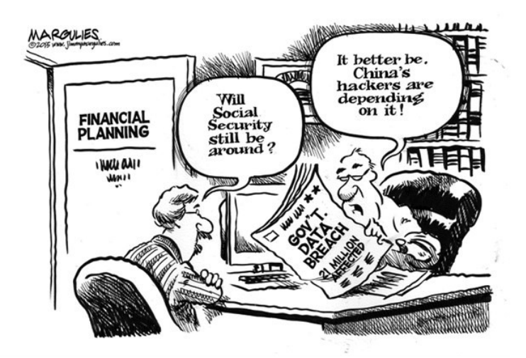
RUSTY HOOK / Summer 2015

From DAVE BRENNEN , $10.00 for 2015 assessment. Thanks DAVE .