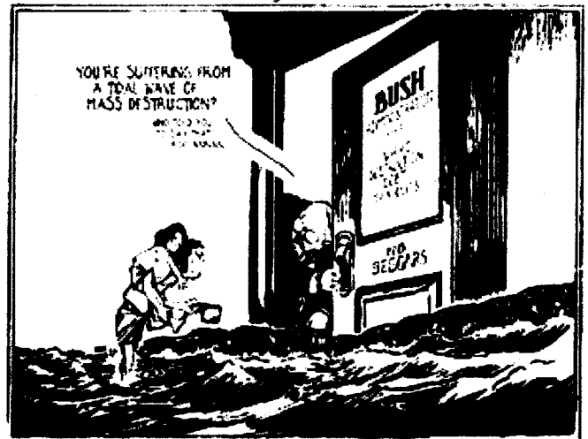
US Accused of Being Slow to Aid Tidal Wave Victims